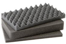
1171 3 pc. Replacement Foam Set