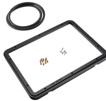
1400PF Special Application Panel Frame