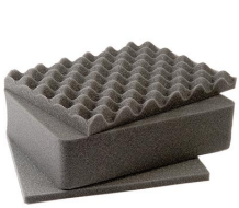
1401 3 pc. Replacement Foam Set