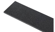
1450TPDIV Extra TrekPak Dividers