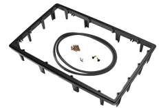
1490PF Special Application Panel Frame