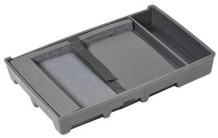
1499C Computer Bottom Insert