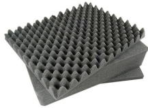
1491 3 pc. Replacement Foam Set