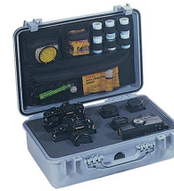
1508 Photographer's Lid Organizer