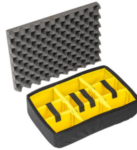
1505 Padded Divider Set