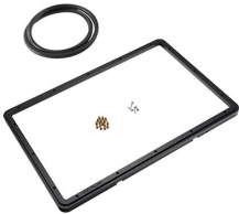
1500PF Special Application Panel Frame