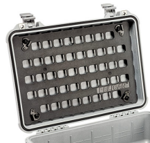
1500MP EZ-Click™ MOLLE Panel