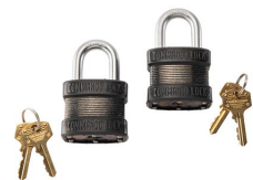
PL2 Padlock (2 pack)