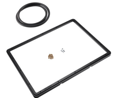
1550PF Special Application Panel Frame