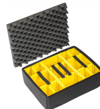
1555 Padded Divider Set