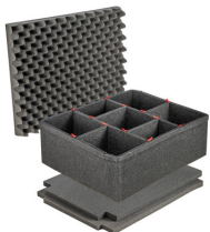
1610TPKIT TrekPak Case Divider Kit