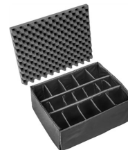
1615 Padded Divider Set