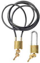
CL2 Cable Lock (2 pack)