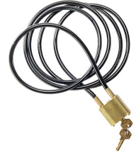
CL1 Cable Lock