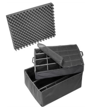
1645 Padded Divider Set