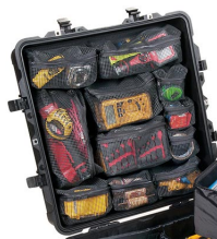
0379 Lid Organizer