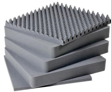
1641 5 pc. Replacement Foam Set