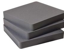
1642 Pick N Pluck™ Sections Only (set of 3)