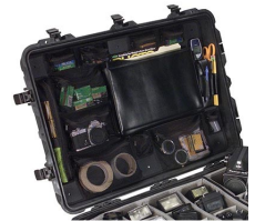
1669 Photo/Lid Organizer