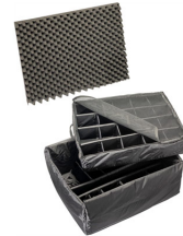
1695 Padded Divider Set