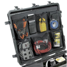
1699 Lid Organizer