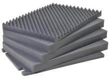
1731 5 pc. Replacement Foam Set