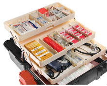
1466 Tray System for 1460EMS