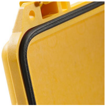
1463 Replacement O-ring