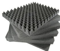
0551 6 pc. Replacement Foam Set