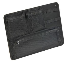
1569 Lid Organizer