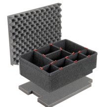
1560TPKIT TrekPak Case Divider Kit