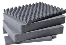
1561 4 pc. Replacement Foam Set