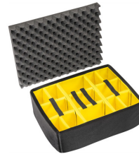
1565 Padded Divider Set