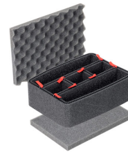
1150TPKIT TrekPak Case Divider Kit