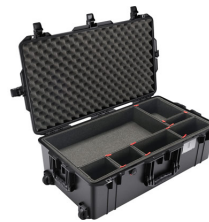
1615TP With TrekPak Divider System