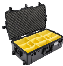
1615WD With Padded Dividers