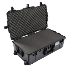
1615WF With Foam