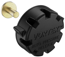
22-IM-VALVE Storm Case Automatic Purge Valve