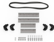
iM20XX-M4-BEZEL Base Bezel Kit (Metric)