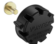
22-IM-VALVE Storm Case Automatic Purge Valve