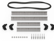
iM2200-BEZEL Base Bezel Kit