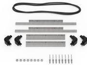
iM2200-BEZEL-LID Lid Bezel Kit