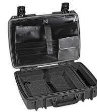
iM2370-X0003 Computer Case Deluxe