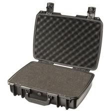
iM2370-X0001 With Foam