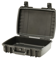
iM2370-X0000 No Foam