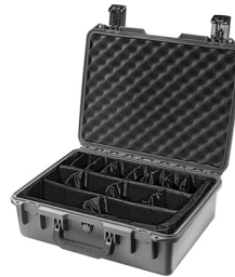
iM2400-X0002 With Padded Dividers