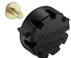
22-IM-VALVE Storm Case Automatic Purge Valve