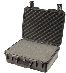
iM2400-X0001 With Foam