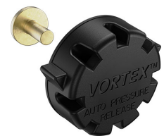
22-IM-VALVE Storm Case Automatic Purge Valve