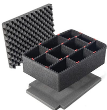
iM2450TPKIT TrekPak Case Divider Kit