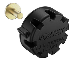
22-IM-VALVE Storm Case Automatic Purge Valve