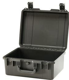
iM2450-X0000 No Foam