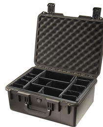
iM2450-X0002 With Padded Dividers