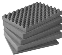
iM2450-FOAM 5 pc. Replacement Foam Set