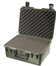
iM2450-X0001 With Foam