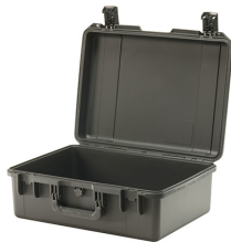
iM2600-X0000 No Foam