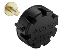
22-IM-VALVE Storm Case Automatic Purge Valve