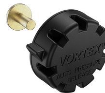
22-IM-VALVE Storm Case Automatic Purge Valve