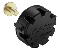
22-IM-VALVE Storm Case Automatic Purge Valve