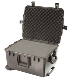
iM2750-X0001 With Foam