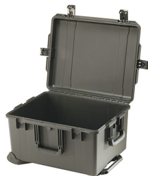
iM2750-X0000 No Foam