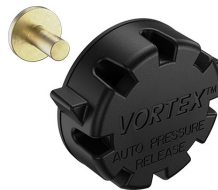
22-IM-VALVE Storm Case Automatic Purge Valve