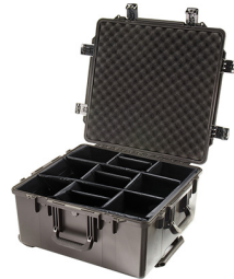
iM2875-X0002 With Padded Dividers