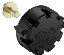
22-IM-VALVE Storm Case Automatic Purge Valve