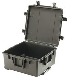
iM2875-X0000 No Foam