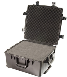
iM2875-X0001 With Foam