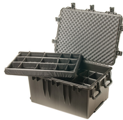
iM3075-X0002 With Padded Dividers