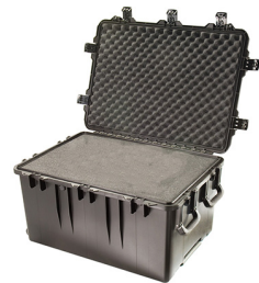
iM3075-X0001 With Foam