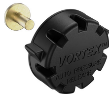
22-IM-VALVE Storm Case Automatic Purge Valve