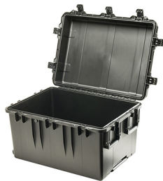
iM3075-X0000 No Foam