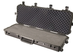
iM3200-X0001 With Foam