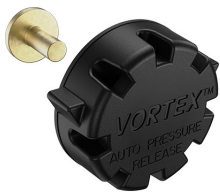
22-IM-VALVE Storm Case Automatic Purge Valve