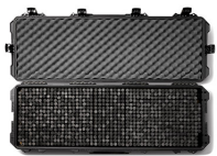
iM3200PRS iM3100 & iM3200 Storm RE-SET Kit