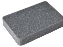
1052 Pick N Pluck™ Foam Insert