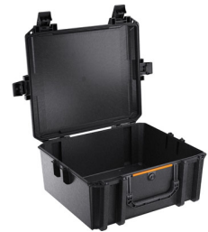
V600NF No Foam