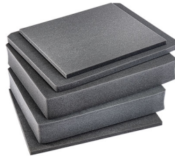
V600FS 4 pc. Replacement Foam Set