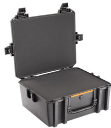
V600WF With Foam