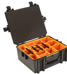
V600WD With Padded Dividers