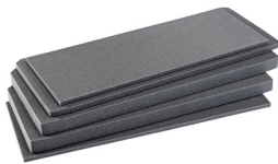
V700FS 4 pc. Replacement Foam Set