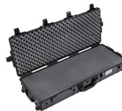
1745WF With Foam