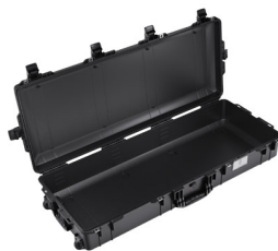
1745NF No Foam