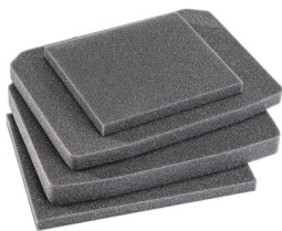
V100FS 4 pc. Replacement Foam Set