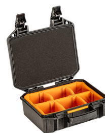
V100WD With Padded Dividers