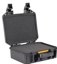
V100WF With Foam