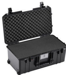
1556WF With Foam