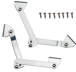
KIT-LIDSTAY-CARGO Cargo Lid Stays