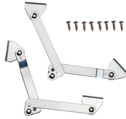
KIT-LIDSTAY-CARGO Cargo Lid Stays