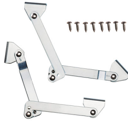
KIT-LIDSTAY-CARGO Cargo Lid Stays