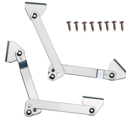
KIT-LIDSTAY-CARGO Cargo Lid Stays