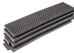
1755AirFS 4 pc. Replacement Foam Set