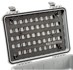
1500MP EZ-Click™ MOLLE Panel