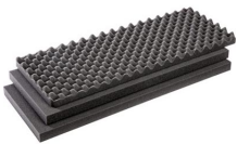
1701FS 3 pc. Replacement Foam Set