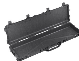
1750NF No Foam