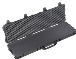
1750WF With Foam