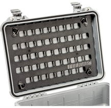
1500MP EZ-Click™ MOLLE Panel