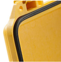
1723 Replacement O-ring