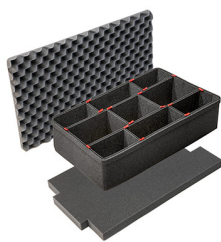
1595TPKIT TrekPak Case Divider Kit