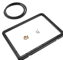
1400PF Special Application Panel Frame