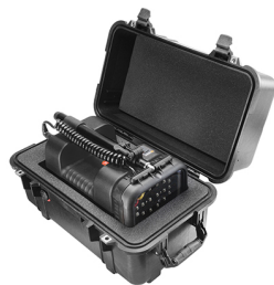
1460AALG With Custom Foam for 9430 / 9435