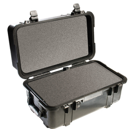
1460WF With Foam