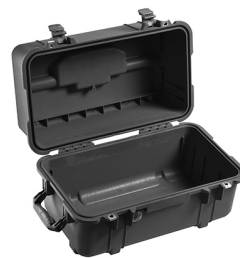
1460NF No Foam