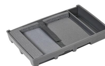
1499C Computer Bottom Insert