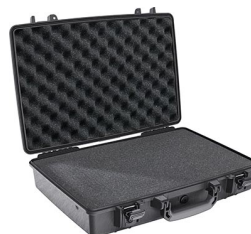
1490WF With Foam