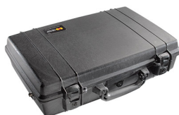
1490NF No Foam