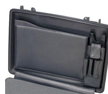
1498 Computer Lid Organizer