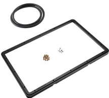
1500PF Special Application Panel Frame