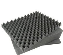
1501 3 pc. Replacement Foam Set

Master Pack 4 Nameplate yes Military yes