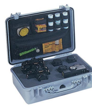
1508 Photographer's Lid Organizer