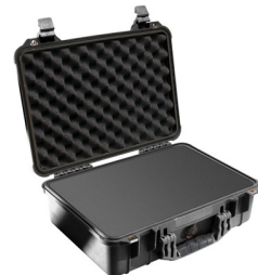
1500WF With Foam