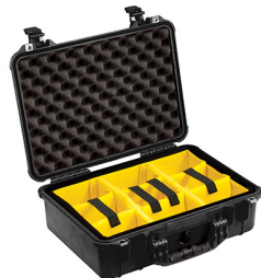
1504 With Padded Dividers