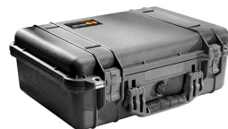
1500NF No Foam