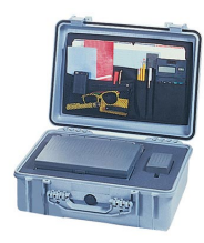
1509 Lid Organizer