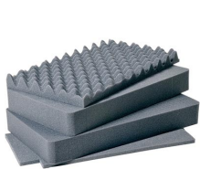
1511 4 pc. Replacement Foam Set