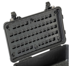
1510MP EZ-Click™ MOLLE Panel