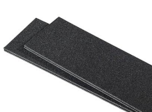
1510TPDIV Extra TrekPak Dividers