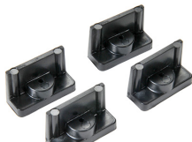
1507QM Quick Mounts - set of 4