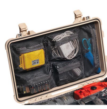
1519 Lid Organizer