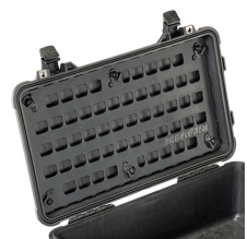
1510MP EZ-Click™ MOLLE Panel