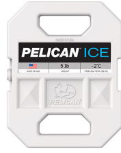
PI-5LB 5lb Ice Pack