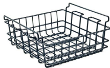
WBSM Dry Rack Basket